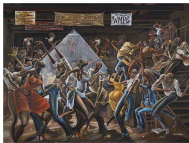
Ernie Barnes, Famous Painter- The Sugar Shack