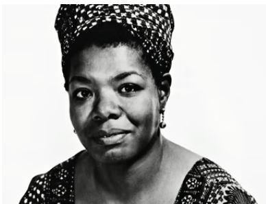
Maya Angelou- Poet

The Black History Month 2024 theme, “ African Americans and the Arts ,” explores the key influence African Americans have had in the fields of "visual and performing arts, literature, fashion, folklore, language, film, music, architecture, culinary and other forms of cultural expression."