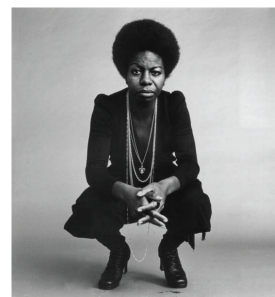
Nina Simone- Musician and Singer

Source: https://www.history.com/topics/black-history/black-history-month